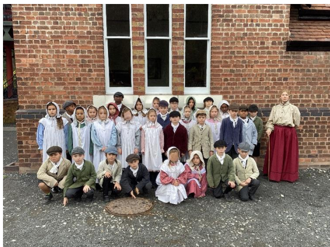
Year 4 at Blists Hill: