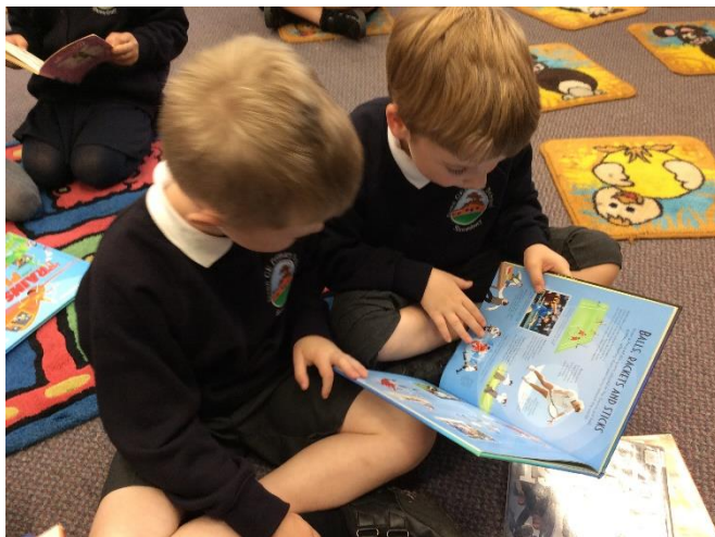
Year 2 at the library: