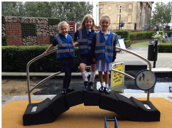
Year 2 at Think Tank: