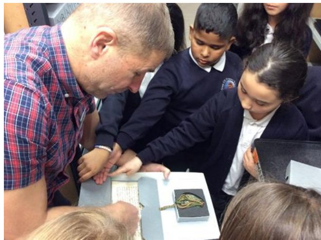
Year 4 at the Shropshire Archives