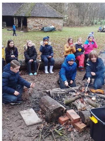
Year 6 at Green Acres Farm