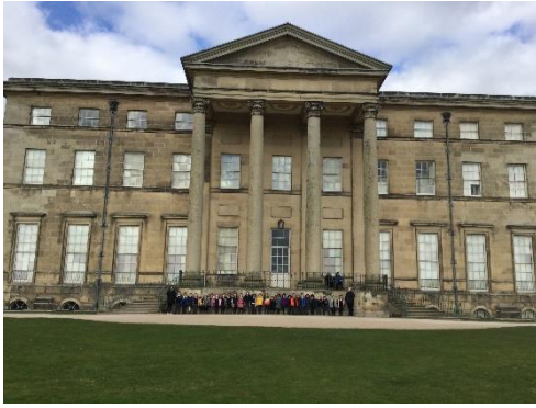
Year 1 at Attingham Park